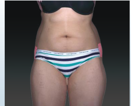
Overlay of before and after 8 treatments