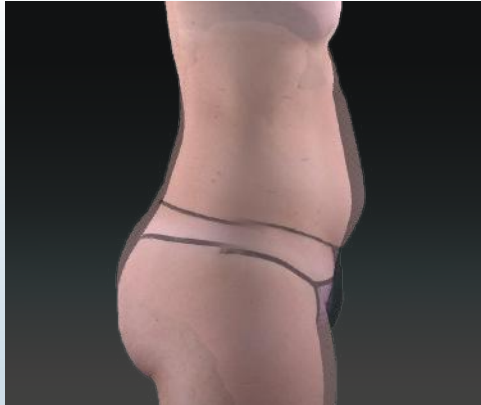
Overlay after 3rd treatment